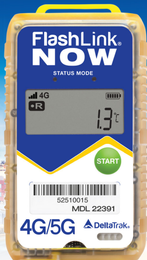
FlashLink® NOW 4G/5G Real Time Logger (Model 22391)