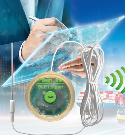
FlashLink® BLE Logger with Sharp Tip Probe (Model 40982)